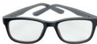
KICK OFFICE PXFOFKI109