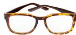
SPICY OFFICE PXFOFSP605