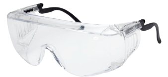
1650515 • Clear wrap around frame