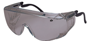
1650516 • Smoke wrap around frame