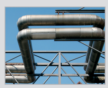
Pipelines subject to pressure