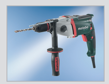
Percussion drilling machine