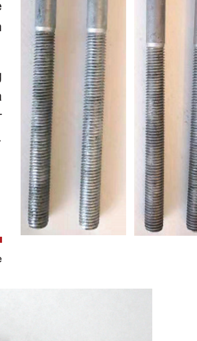
Figure 2: Bottom Bolt with the previous shinier finish compared to the current darker and flatter look on the top 3 bolts.